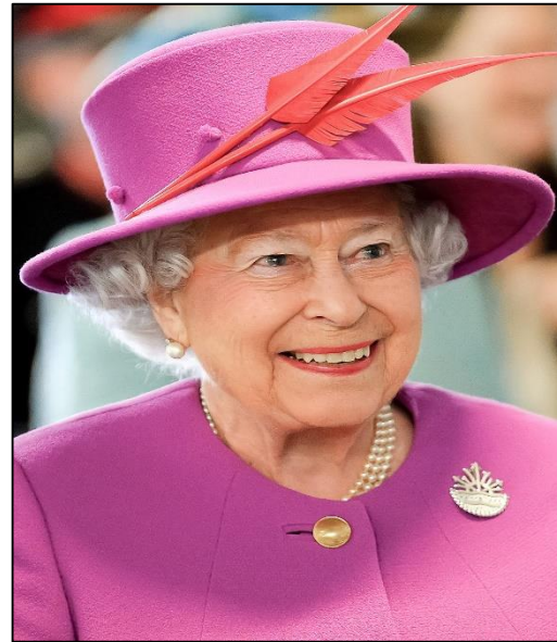
A photograph of Elizabeth II from 2015.

She celebrated her Platinum Jubilee (70 year reign) in 2022.