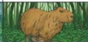
un capybara (m)