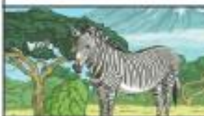
un zèbre (m)