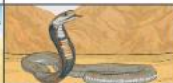
un cobra (m)