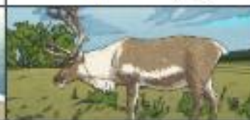
un renne (m)