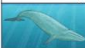
une baleine (f)