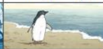
un pingouin (m)