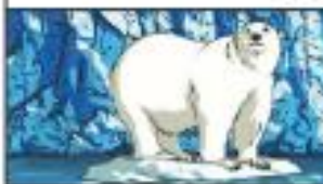
un ours polaire (m)