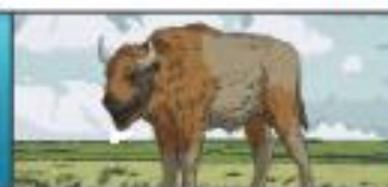
un bison (m)