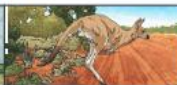
un kangourou (m)