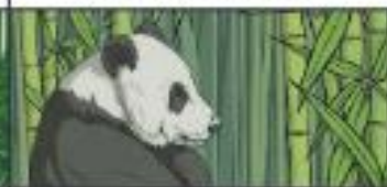
un panda (m)