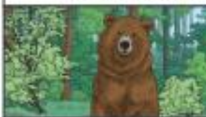
un ours brun (m)