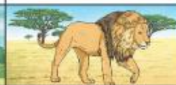
un lion (m)